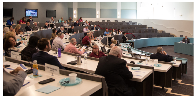
At IMPA Board Meetings, a representative from your community helps guide the direction and decisions of the Agency.

Public power utilities are not just there to provide power – they work for the betterment of the community, too. These utilities are embedded in the fabric of their communities—boosting community investment, supporting local education, and getting involved with beautification and charitable programs. As a result, public power customers benefit from affordable energy, better service, local control, and a utility that cares about the overall well-being and growth of your community. •