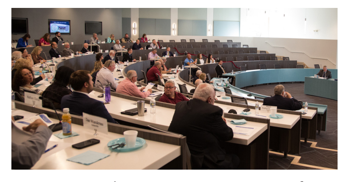
At IMPA Board Meetings, a representative from your community helps guide the direction and decisions of the Agency.

Public power utilities are not just there to provide power - they work for the betterment of the community, too. These utilities are embedded in the fabric of their communities—boosting community investment, supporting local education, and getting involved with beautification and charitable programs. As a result, public power customers benefit from affordable energy, better service, local control, and a utility that cares about the overall well-being and growth of your community.•