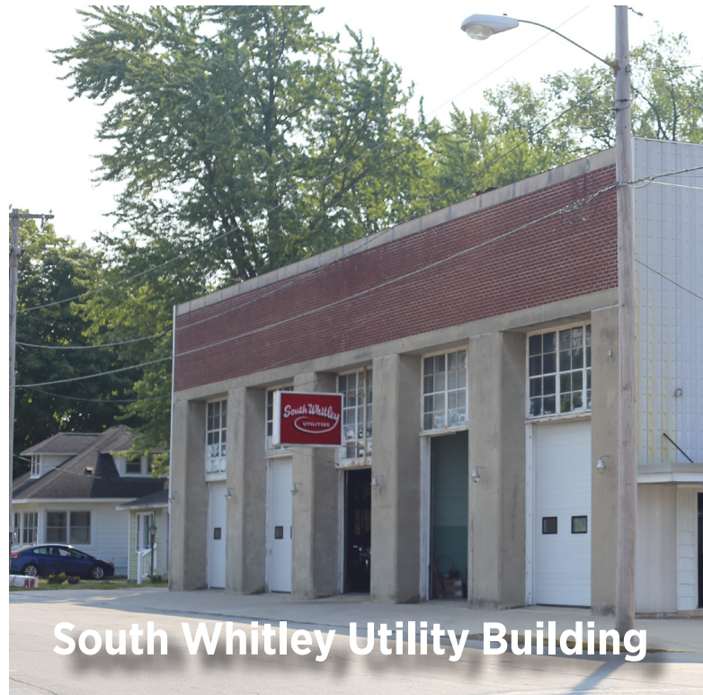
South Whitley Utility Building

Reach out to newsletter@impa.com to suggest topics for future Municipal Power News newsletters and let us know what articles you enjoy most, and what you'd like to see next!