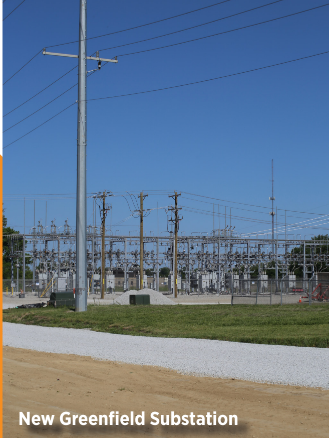
New Greenfield Substation