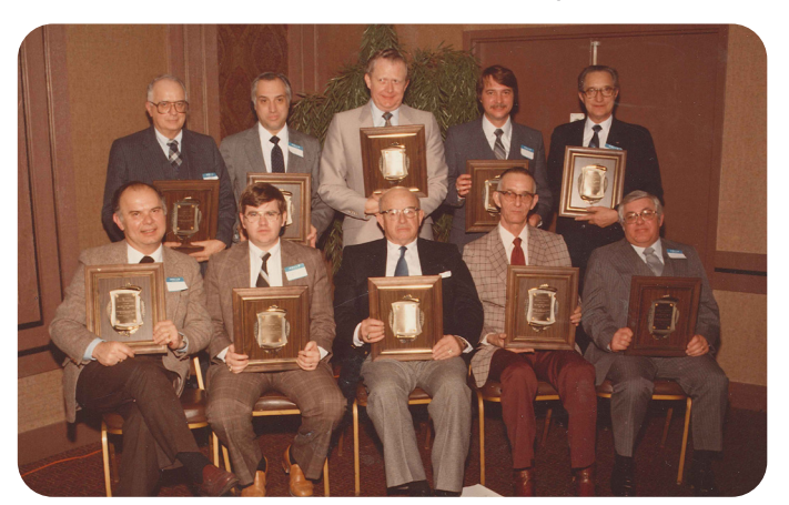
Some of the founders of IMPA

By 1980, Indiana state legislation was passed allowing the 11 representative communities to unite in the purchase of