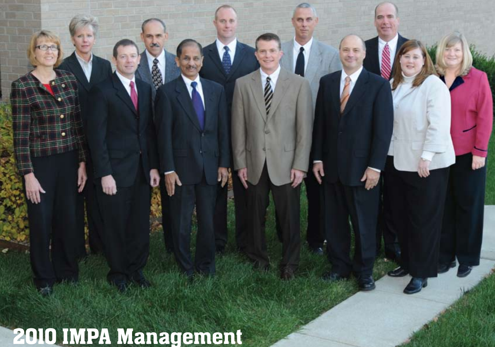
2010 IMPA Management