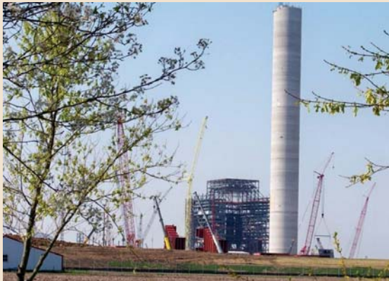
View of Prairie State Energy Campus stack-boiler