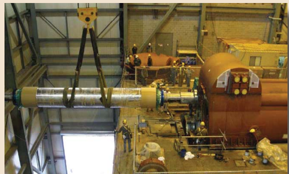
Installing generator rotor on Trimble County Unit 2

The Trimble County Unit 2 project is 55 percent complete. Construction is concentrated on the boiler tube weld-out, AQCS system installation, and steam turbine installation. Other areas of work include finishing and starting-up the new fly-ash facility, construction of the fuel blending system, and installation of the new auxiliary boiler. ☺