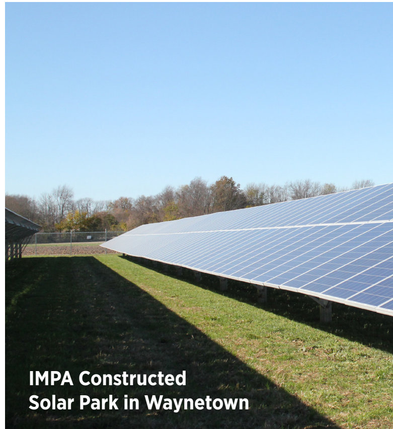
IMPA Constructed Solar Park in Waynetown

Reach out to newsletter@impa.com to suggest topics for future Municipal Power News newsletters and let us know what articles you enjoy most, and what you'd like to see next!