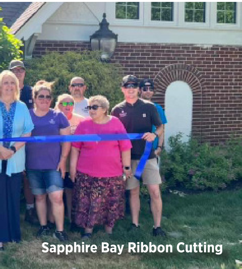
Sapphire Bay Ribbon Cutting