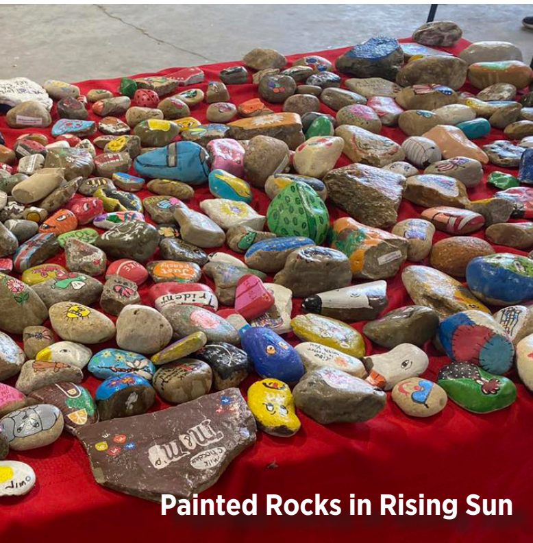
Painted Rocks in Rising Sun