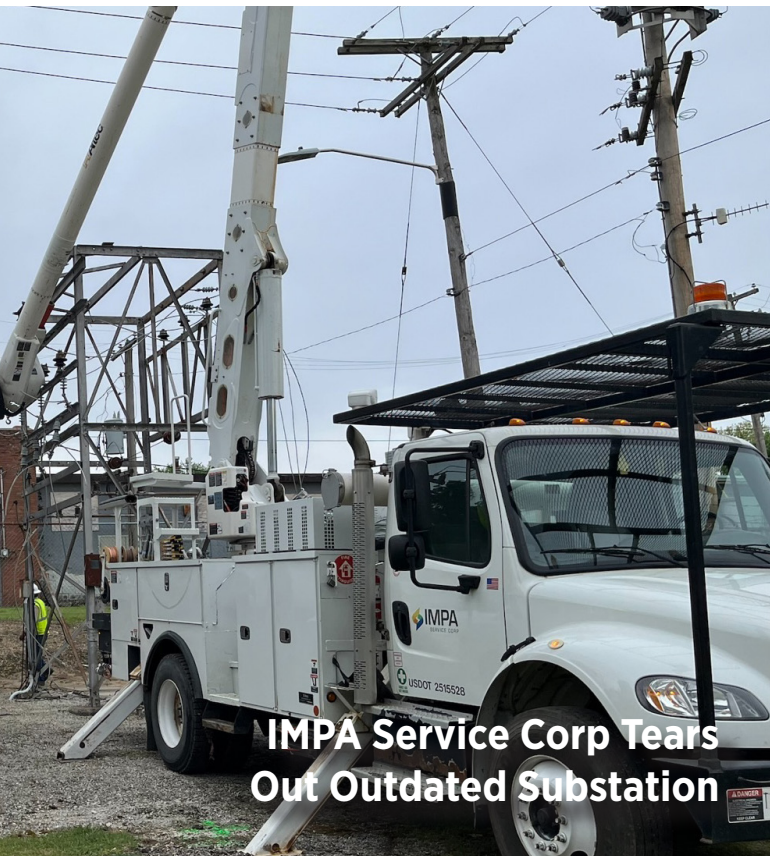
IMPA Service Corp Tears Out Outdated Substation

back on automatically to test whether the issue was simply temporary. Reclosers are programmed to stay on if the power issue was temporary—such as if the cause was simply lightning, a bird, or a tree limb—but permanently shut off if it detects an issue when a certain number of occurrences happen in a small frame of time. All of this typically happens in a matter of seconds. If a recloser remains off, a line crew must then come to