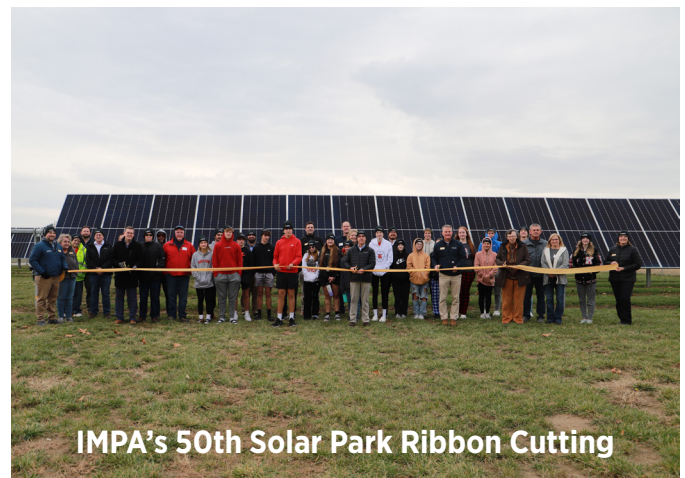
IMPA’s 50th Solar Park Ribbon Cutting

the Agency’s solar park program has grown exponentially in under 10 years. The Agency now has over 196 MW of solar power in member communities. Plans are already underway for four additional parks, and the Agency expects to surpass 209 MW of solar capacity by the end of 2025. The solar park program plays a key role in IMPA’s diverse power supply portfolio, and with its proven success rate, the Agency continues to provide a diverse fuel mix that benefits both consumers and the environment. •