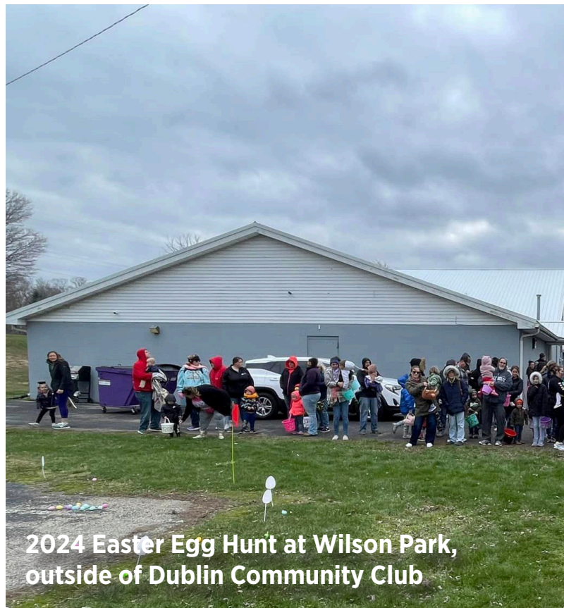
2024 Easter Egg Hunt at Wilson Park, outside of Dublin Community Club

Reach out to newsletter@impa.com to suggest topics for future Municipal Power News newsletters and let us know what articles you enjoy most, and what you'd like to see next!