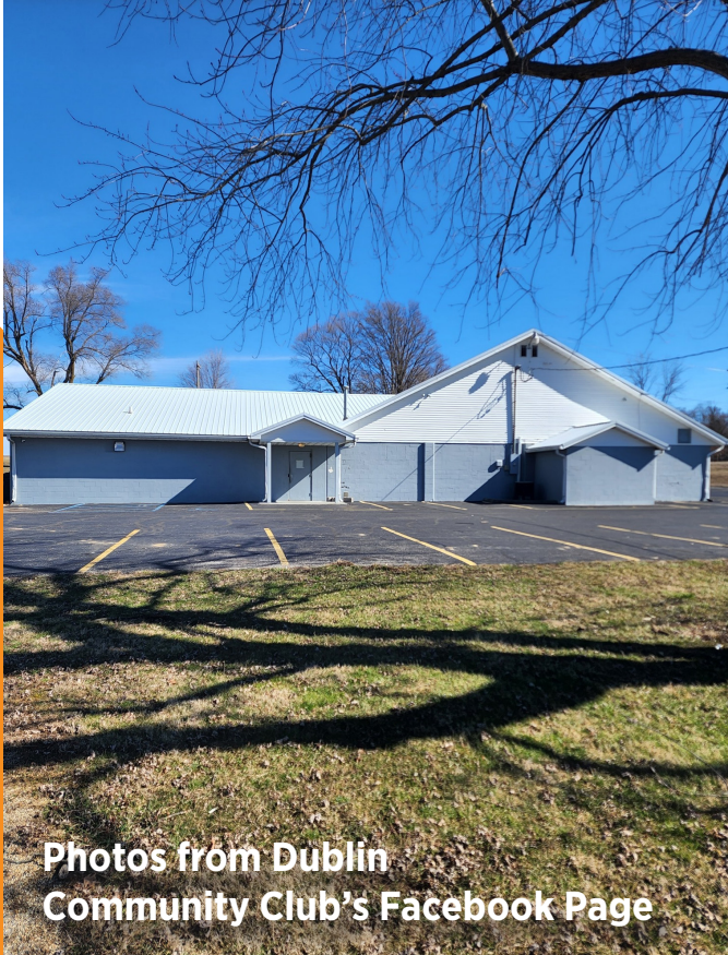
Photos from Dublin Community Club's Facebook Page

Dublin Municipal Electric and Water Volume 29, Issue 1 | Spring 2024