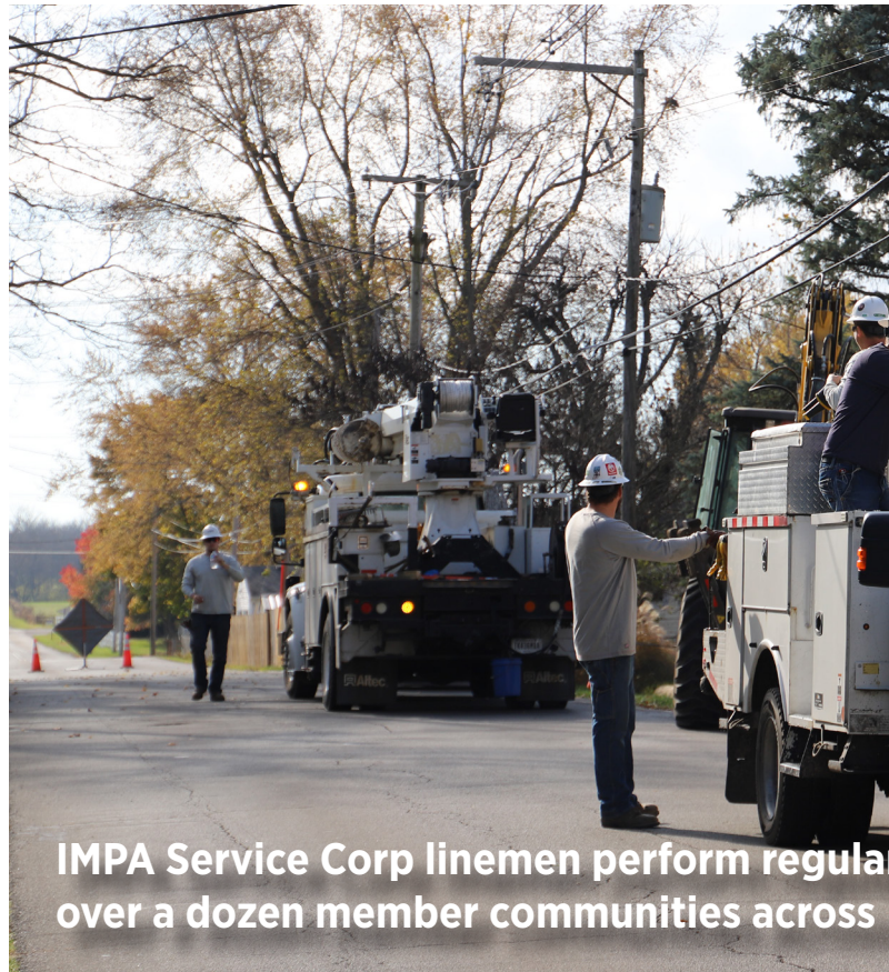
IMPA Service Corp linemen perform regular maintenance over a dozen member communities across

Reach out to newsletter@impa.com to suggest topics for future Municipal Power News newsletters and let us know what articles you enjoy most, and what you'd like to see next!