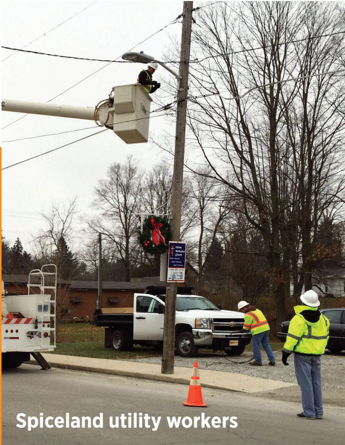
Spiceland utility workers