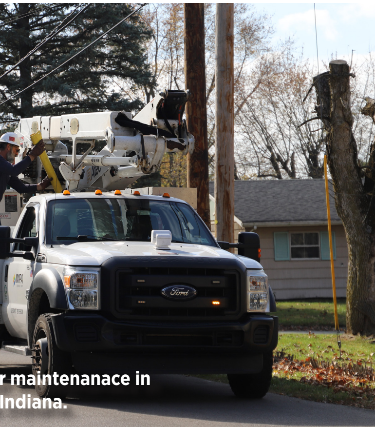
er maintenance in Indiana.

is substantially more efficient. Additionally, the town is helping the manufacturer refurbish overhead power lines and bury them underground.