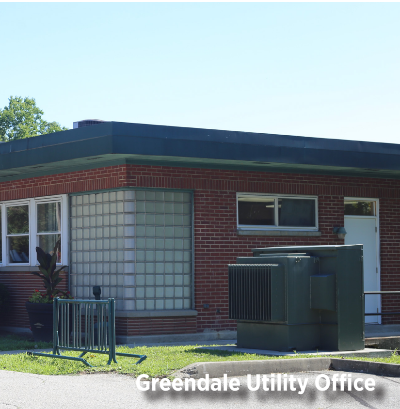
Greendale Utility Office