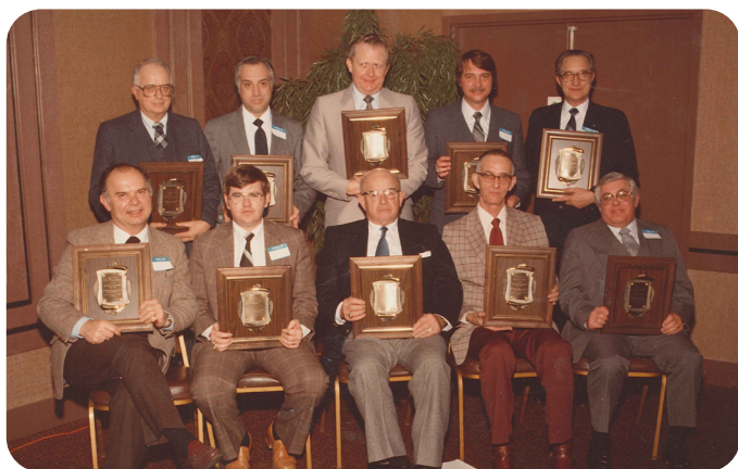
Some of the founders of IMPA

IMPA initially began in 1983 with 24.95% ownership in a coal-fired baseload generating facility called Gibson 5 in southwestern Indiana. As the Agency’s membership grew throughout the decades, IMPA would come to acquire additional power supply resources to support its