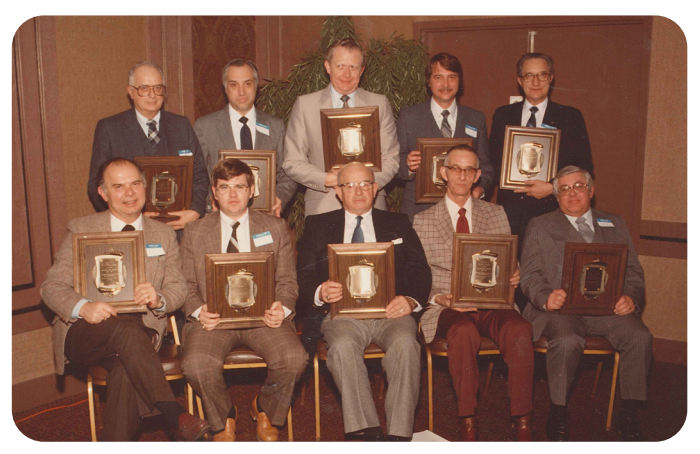
Some of the founders of IMPA

By 1980, Indiana state legislation was passed allowing the 11 representative communities to unite in the purchase of