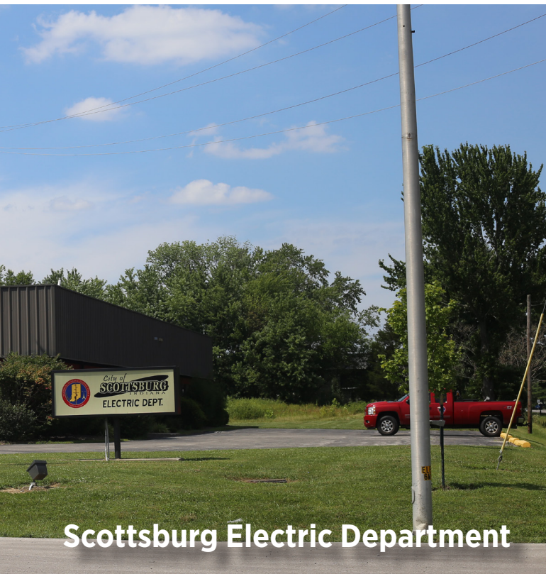
Scottsburg Electric Department