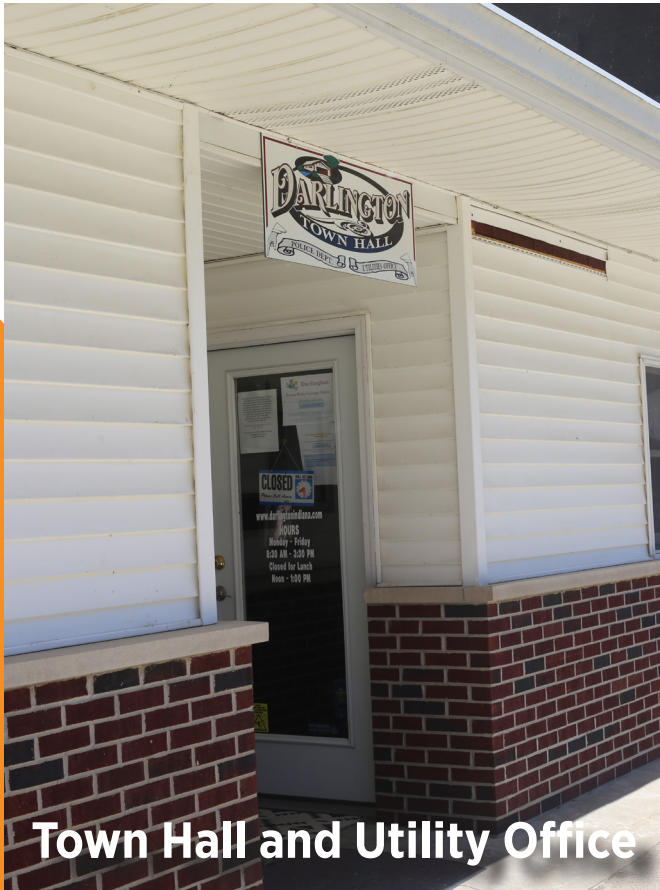
Town Hall and Utility Office