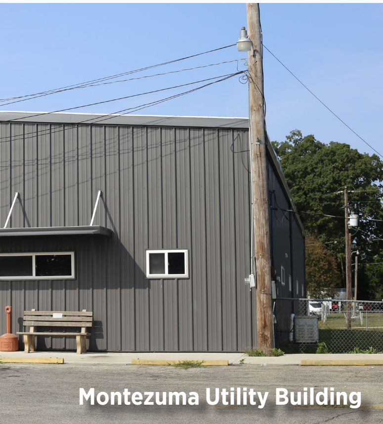
Montezuma Utility Building

Since Montezuma, Rensselaer, Scottsburg, and Washington are public power utilities, anyone who loses power in their area could be a neighbor, friend, or family member of the linemen working to restore the outage. The compassion for the local communities contributes to public power crews' intentional and efficient work in giving the best electric service possible. This lends itself to regional towns and cities banding together to ensure