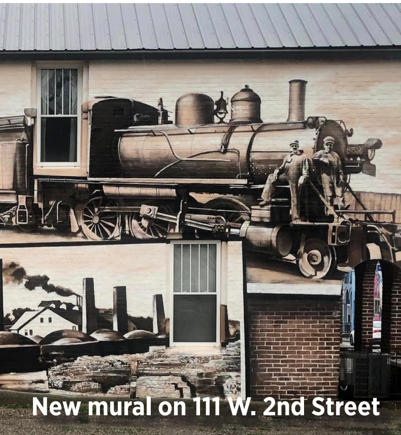
New mural on 111 W. 2nd Street

The historic mural complements another recently completed mural that was added to the community in 2021. This first colorful mural of peonies—the Indiana state flower—remains a beloved piece downtown. Murals and professional street art are a growing medium popping up in hundreds of communities around the country. These art pieces not only beautify public spaces, but in Veedersburg’s instance, can also memorialize a historic time in a community. ●