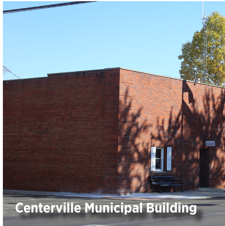
Centerville Municipal Building

Reach out to newsletter@impa.com to suggest topics for future Municipal Power News newsletters and let us know what articles you enjoy most, and what you'd like to see next!