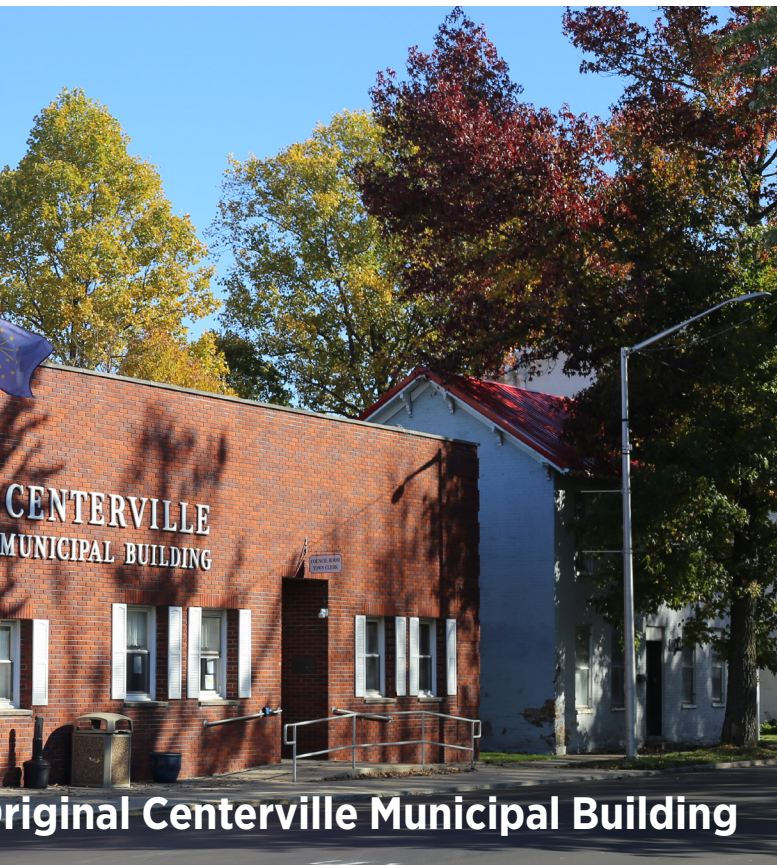
Original Centerville Municipal Building