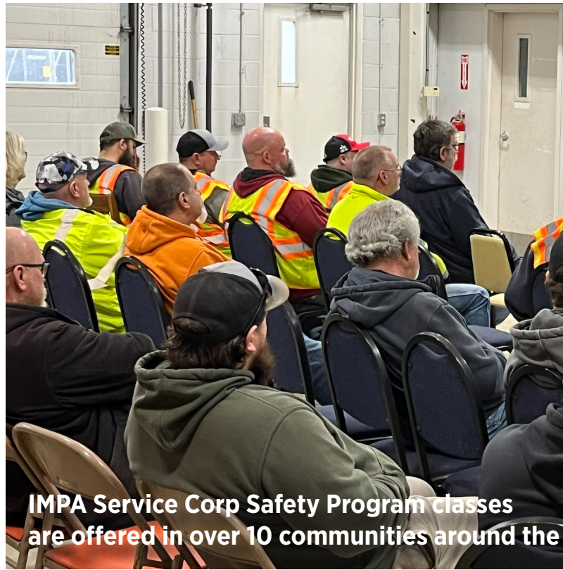
IMPA Service Corp Safety Program classes are offered in over 10 communities around the

Reach out to newsletter@impa.com to suggest topics for future Municipal Power News newsletters and let us know what articles you enjoy most, and what you'd like to see next!