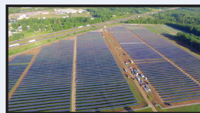
The photo above shows the progress of the 7.44 MW Richmond Solar Park as of June 2018.

A new site will also be constructed in Tipton. Tipton's 5.25 MW solar park construction is expected to begin in October 2018. W